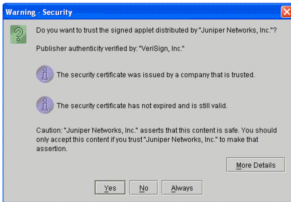
Fig. 3: Security Warning