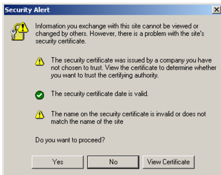
Fig 1: Security Alert